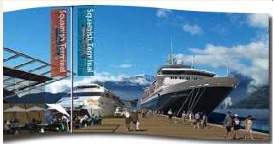
A Vision of the Future of Squamish